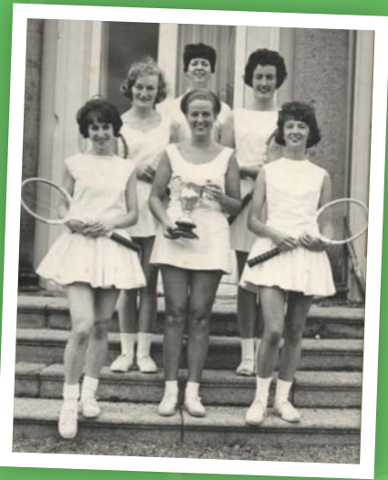
1965: Ladies' Summer League Class 1 Winners

In 1965 the club won the Ladies' Summer League Class 1 and in 1969, a men's team won the DTLC Class 1 League. Between 1961 and 1991 the tennis section accumulated 68 winners' pennants, a truly impressive achievement of which it can be very proud.