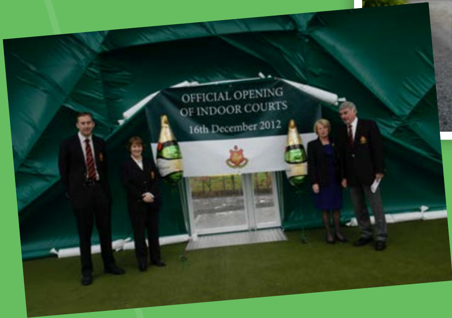
🕒 Official opening of “The Dome” in 2012

Two new hard courts (now courts 6 and 7) with floodlighting were officially opened in 1993, replacing two of the existing grass courts.