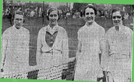
Ladies' Doubles Hardcourt Championships 1938

Elm Park Tennis Club reopened at Nutley House in June 1936 with four cement courts and five grass courts and in 1937 hosted the annual Irish Hardcourt Championships for the first time. The Club continued to provide a home for this event for the next 14 years.