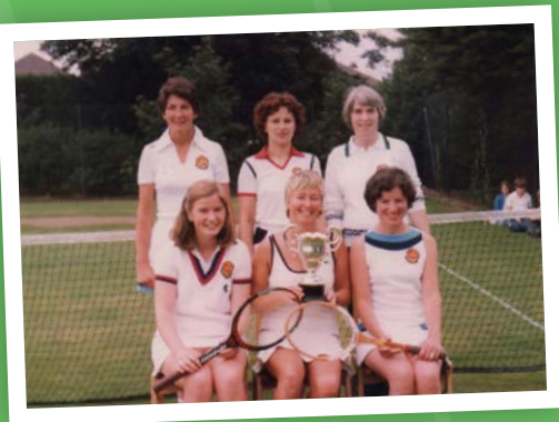
Elm Park Ladies 1st Team. Winners Class 1 Summer League 1980

Two major milestones for Elm Park – one of the men's teams played in class 1 of the Dublin Lawn Tennis Council (DLTC) Summer Leagues for the first time and a ladies' team won the DLTC Class 3 Summer League – the Club's first inter-club honour and first pennant.