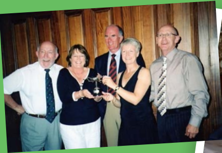
Group at annual Banbridge event Banbridge Trophy

In 1979, Elm Park hosted Banbridge Tennis Club in an inaugural cross-border event. This was during the height of the Troubles and cross-border initiatives were few and far between at the time. The event was so popular that Elm Park has played Banbridge annually during the summer, alternating home and away fixtures, ever since.