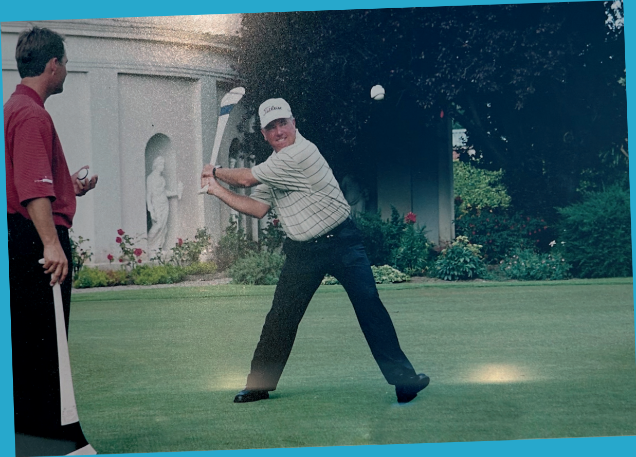
2003 Hurling on the Putting Green. Mark O'Meara USPGA Tour Professional, US Masters and British Open winner visits Elm Park